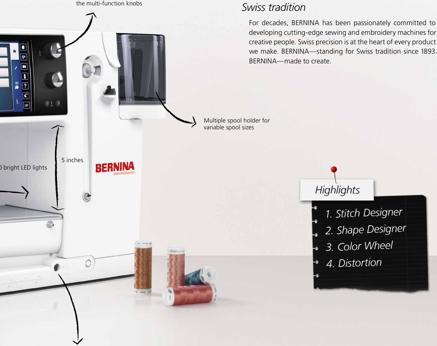
BERNINA Free Hand System (FHS)

developing cutting-edge sewing and embroidery machines for creative people. Swiss precision is at the heart of every product we make. BERNINA—standing for Swiss tradition since 1893.